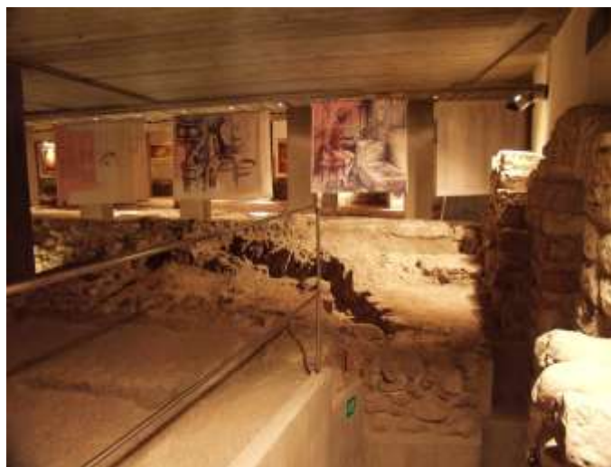
Roman Trento Underground Zone