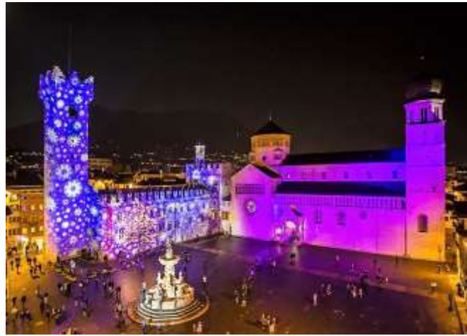
Trento Piazza Duomo