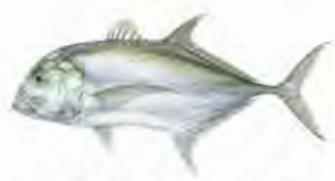
Crevalle Jack – Jurel Caranx caninus