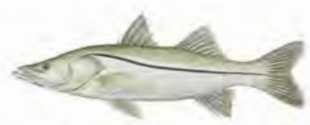
Snook – Robalo Centropomus undecimalis