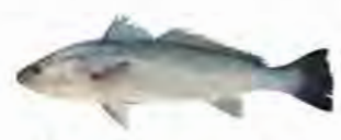
Meagre – Corvina Argyrosomus regius