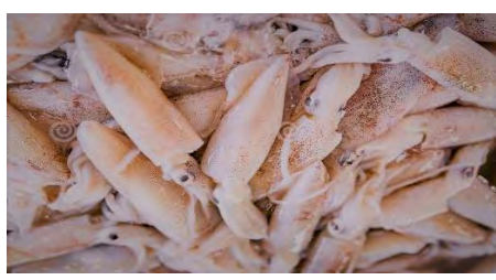
Squid (By Season)