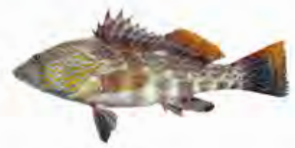
Comber – Cabrilla Serranus cabrilla